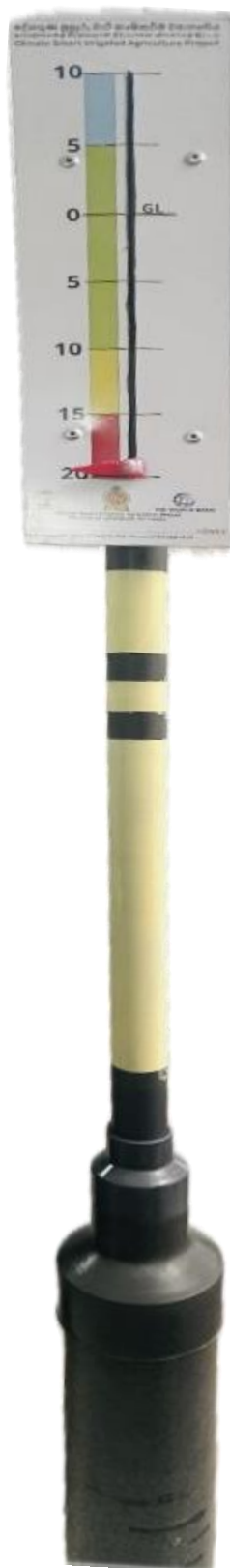
Alternative Wet & Dry Method – AWD tube Colour code apparatus